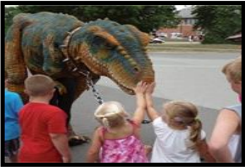
Rexie the "Live" T-Rex