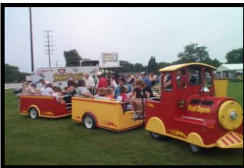
Little Boots Railroad