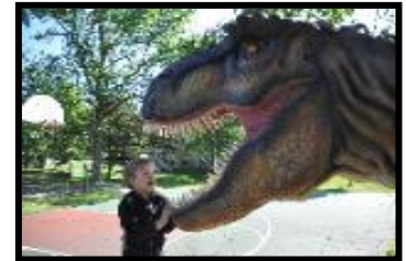
Smell the Breath of a Dinosaur