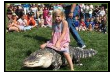
Bubba the Alligator