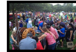
Panning for Gold

FREE OSCAR MEYER HOT DOG AND DRINK FOR PUNCH CARD PARTICIPANTS