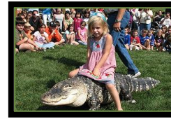
See Bubba the Alligator