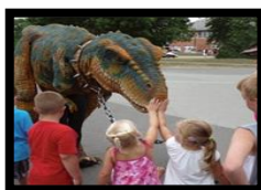
Meet Rexie the "Live" T-Rex