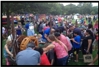
Panning for Gold